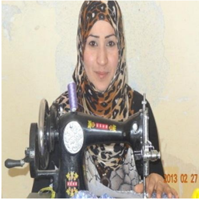
Young mine survivor enrolled in the first sewing class

Therefore, with support from private Americans like you, the U.S. State Department, the Iraqi and UXO Clearance Organization (IMCO), and the Polus Center, MLI launched the Partnership for Iraq program in 2012. This program is the first of its kind and is creating a unique and centralized system to: 1) provide vocational training and medical assistance for survivors, 2) provide specialized training and equipment for Iraqi doctors so that they will be able to better assist mine survivors, and 3) create a national registration list for mine survivors, so that their needs can be better assessed and met. In the past two months, the first 90 landmine survivors began