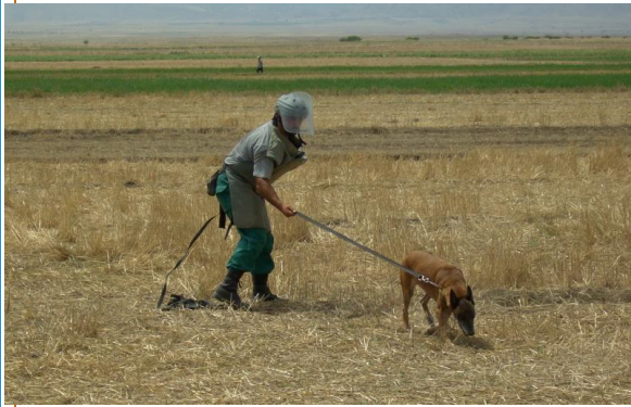
MDD Duco and his handler, Mais, have worked together since 2005 and have cleared 1,071,600 square meters of mine-contaminated land!