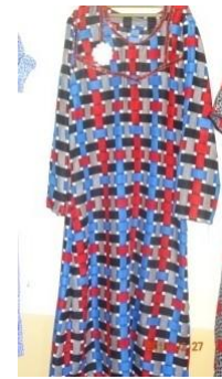
Dress sewn by a mine survivor in class

Thank you for your continued support of the Marshall Legacy Institute (MLI) and for your efforts to help us make the world a better and safer place for all.