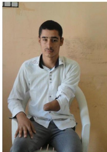
This young man lost his lower arm in a mine explosion and, through the PFI program, will be provided with a prosthetic arm and hand