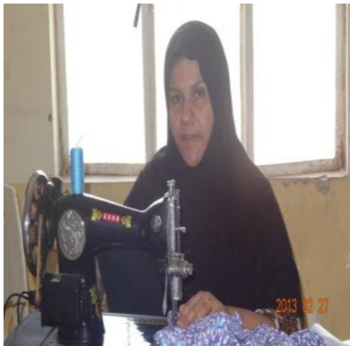
This woman lost her left leg in a mine explosion and is now learning to sew to help support herself and her family