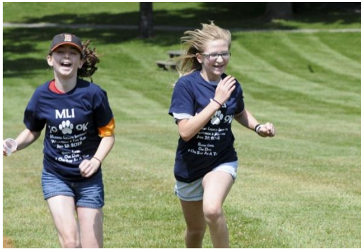
Having a blast at last year's K9-9K!