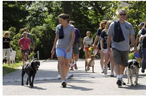
K9-9K participants during the 2012 walk!