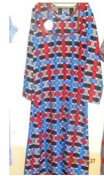
Dress sewn by a mine survivor in class

Thank you for your continued support of the Marshall Legacy Institute (MLI) and for your efforts to help us make the world a better and safer place for all.