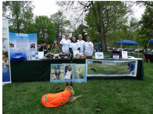
MLI team with retired MDD Dino , who is resting after a long walk and performing a live mine demonstration