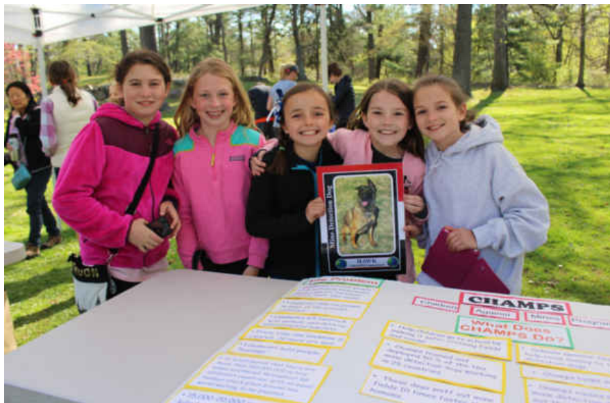
CHAMPS youth from North Mianus and Cos Cob schools in Greenwich, CT participate in their annual CHAMPSathon to raise funds for a life-saving Mine Detection Dog