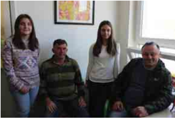
Survivors visit Bosnian CHAMPS schools to thank children for their hard work