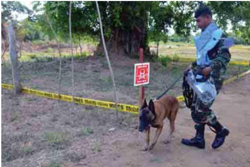
MDD Madjesty and his handler on their way to the minefield